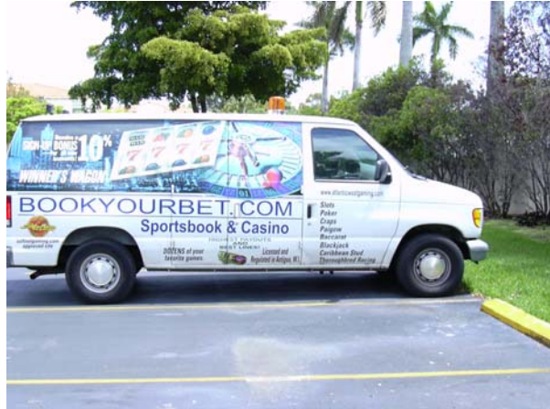
Our Promotion Van